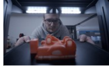
KARLSRUHE UNIVERSITY DELIVERS ADVANCED ENGINEERING AND TECHNICAL TRAINING WITH METHOD X 3D PRINTER