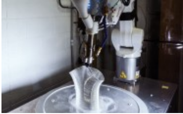
BVN AND UTS INVENT ROBOTIC 3D-PRINTED AIR COOLING SYSTEM